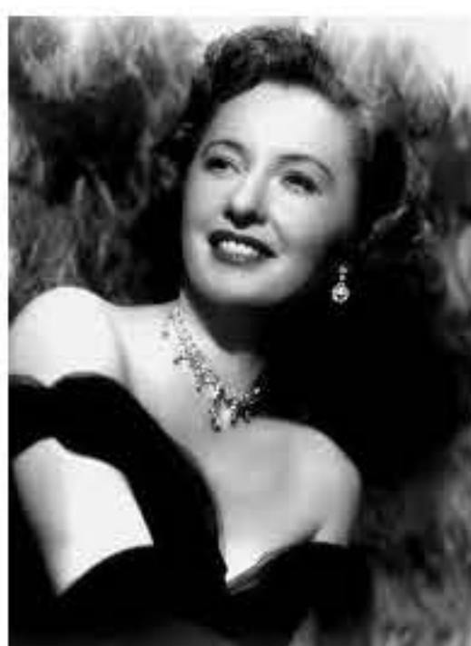
Barbara Stanwyck - Publicity Shot